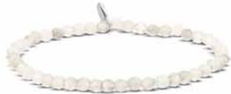
1076 mop w