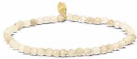
1076 mop b